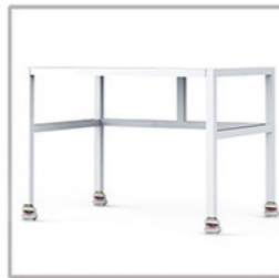
Base Stand Optional